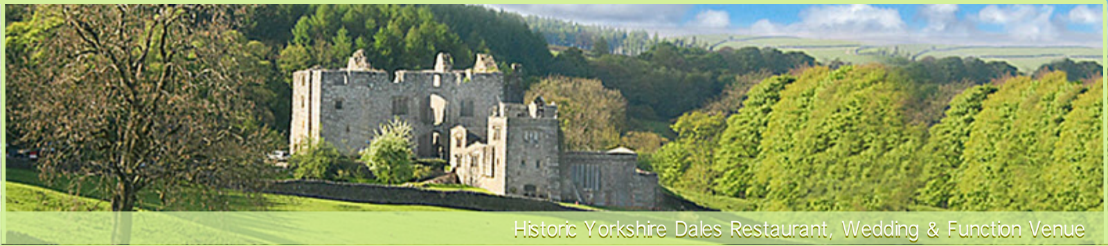
Historic Yorkshire Dales Restaurant, Wedding & Function Venue