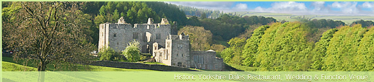
Historic Yorkshire Dales Restaurant, Wedding & Function Venue